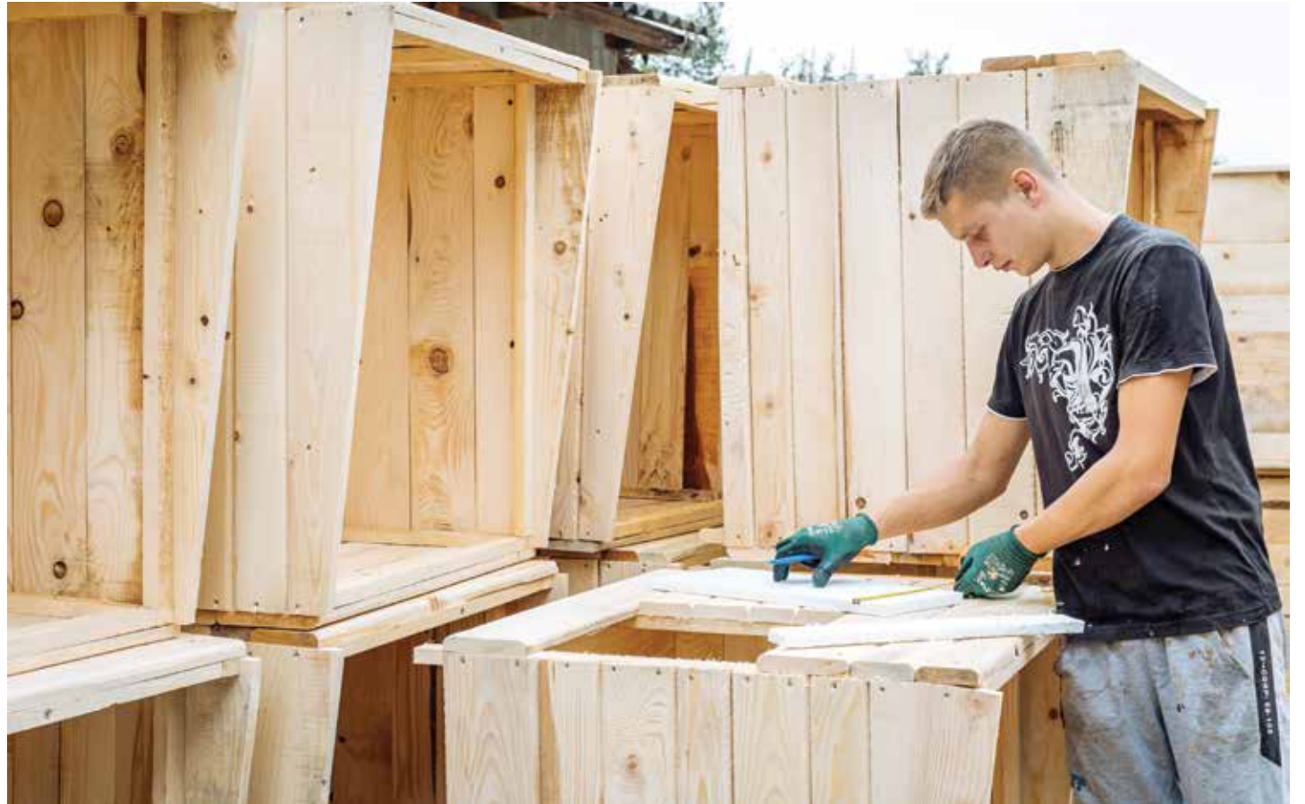
Building insulated dog houses.