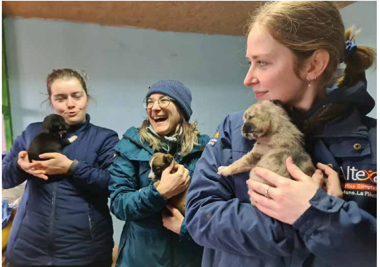
Holding puppies at Fundacia Sky.